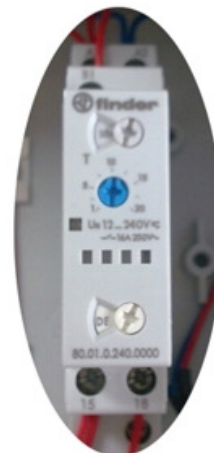
Multi range timer